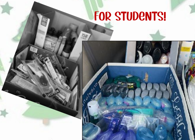
Some of the items donated, including soap, deodorant, feminine products, toothbrushes and toothpaste, etc.