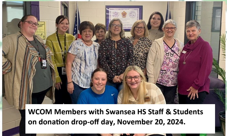
WCOM Members with Swansea HS Staff & Students on donation drop-off day, November 20, 2024.