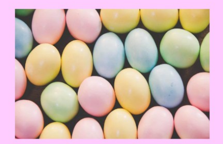
Thirty-six (36) eggs = $35.00