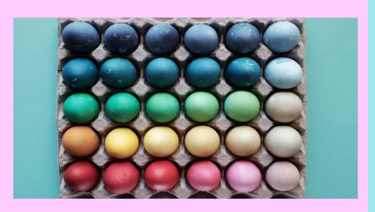
Forty-eight (48) eggs = $45.00

The club women will hide plastic eggs, filled with candy and/or toys, in your front yard. (Prepay) Egg delivery available within Lexington, Cayce, West Columbia, Columbia, and Irmo between April 6<sup>th</sup> – April 19<sup>th</sup>, 6PM – 9PM.