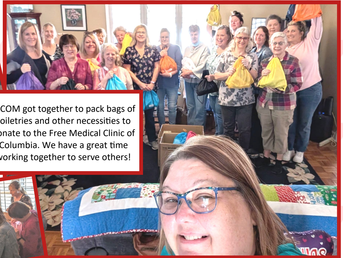
WCOM got together to pack bags of toiletries and other necessities to donate to the Free Medical Clinic of Columbia. We have a great time working together to serve others!